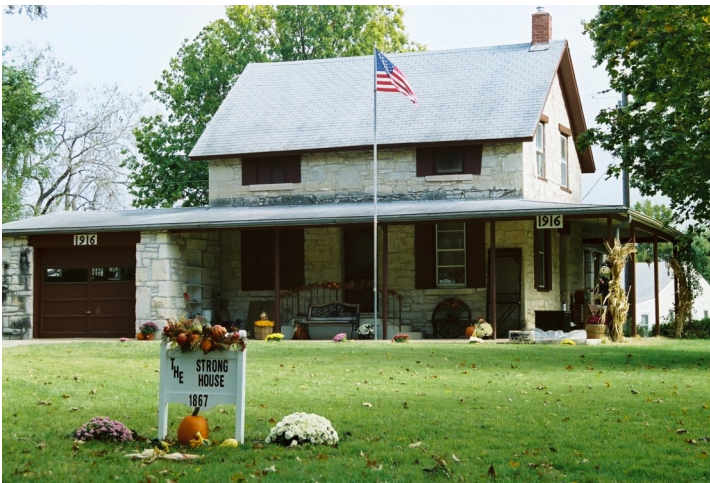
The Strong House, 2007.

Exhibit open hours are 8:30 am to 5:00 pm, Tuesday through Friday and 2:00 pm to 5:00 pm, Saturday and Sunday.