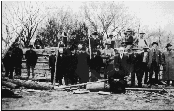
1914 Historical Association (Society) founded. 1915 Log Cabin construction began.