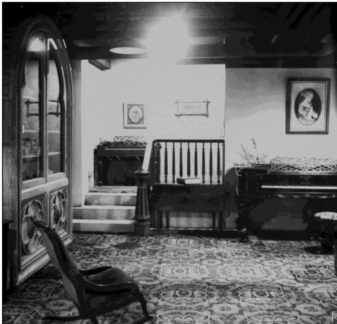
1957 City Hall basement provided exhibit space for twenty years.