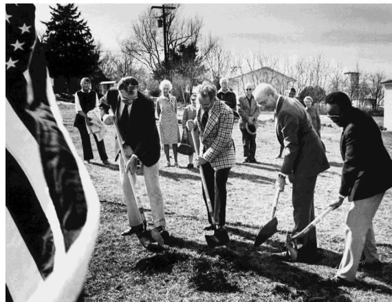
1976 July 4th groundbreaking for Museum at 2309 Claflin Road.