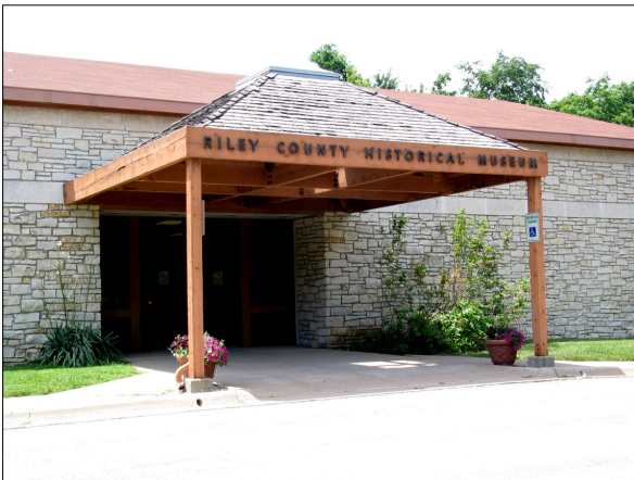
Riley County Historical Museum